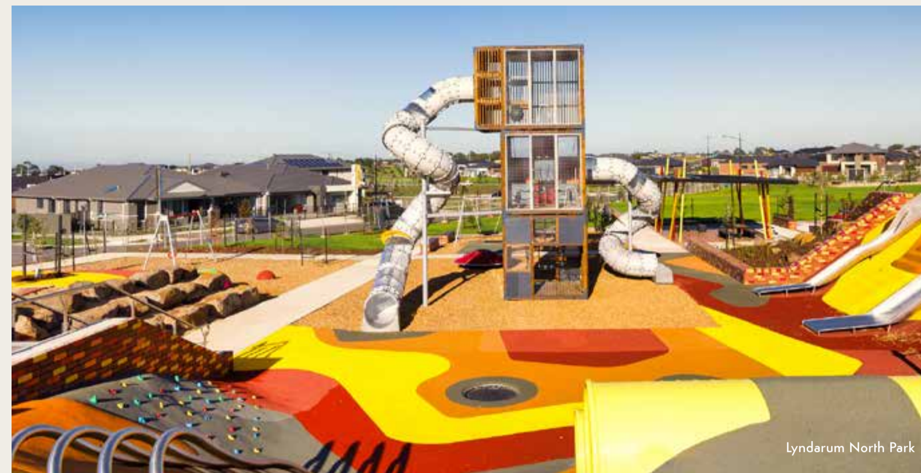
Lyndarum North Park