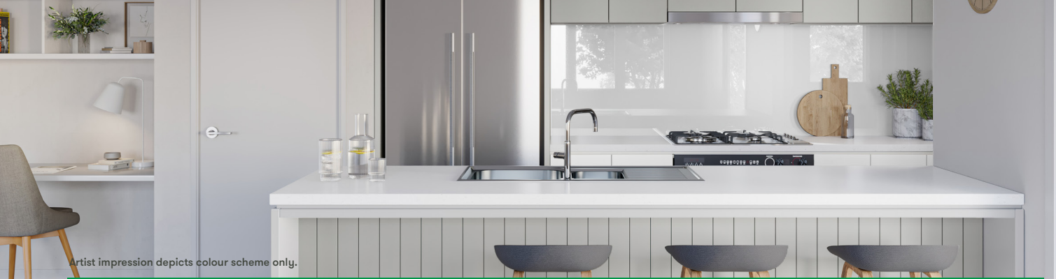
Artist impression depicts colour scheme only.