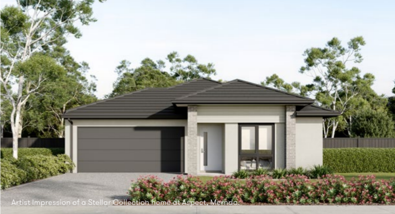
Artist Impression of a Stellar Collection home at Aspect, Merinda.

Like all of our turnkey homes range, The Stellar Collection homes are all architecturally designed and offer a range of benefits like contemporary, open plan living, stunning colour schemes, fittings and fixtures and come fully landscaped; so all you need to do is move in.