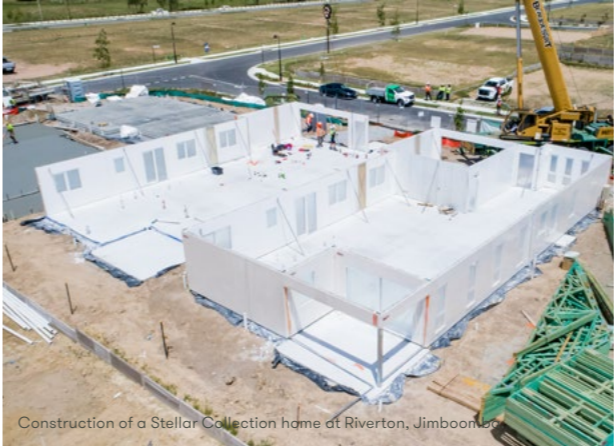
Construction of a Stellar Collection home at Riverton, Jimboomba.