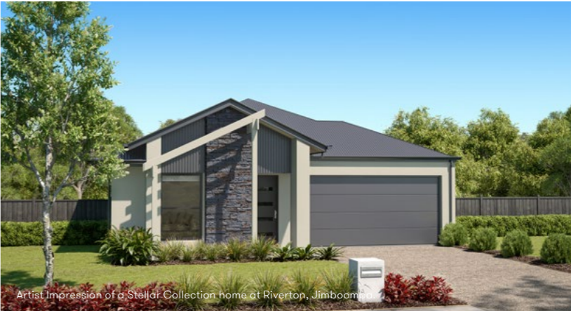
Artist Impression of a Stellar Collection home at Riverton, Jimboomba.